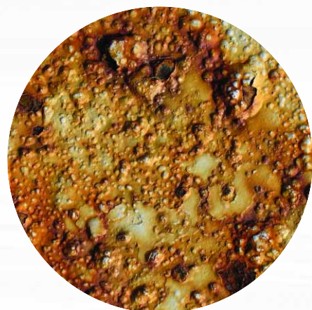
Spoiled Paint Finish