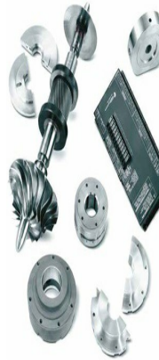
Peças de reposição