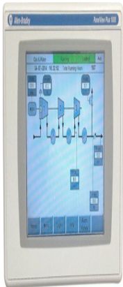
Sistema de controle de