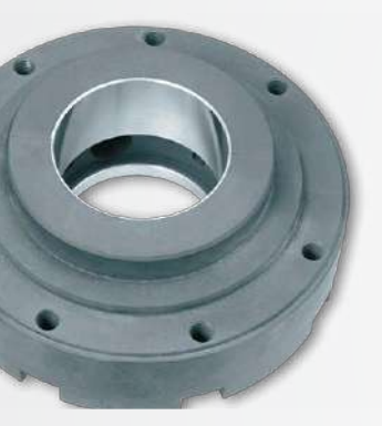
Babbitted Air Seal