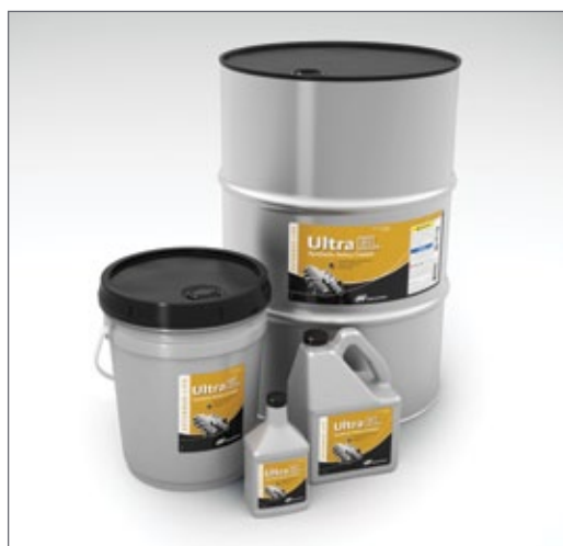
Ultra EL comes in four standard sizes – 1 liter, 5 liters, 15 liters or a 208 liter drum.

Ultra EL is available for use in all rotary screw compressors and comes in four standard sizes. Ultra EL is also fully compatible with Ultra Coolant, making it quick and easy to upgrade your compressed air system.