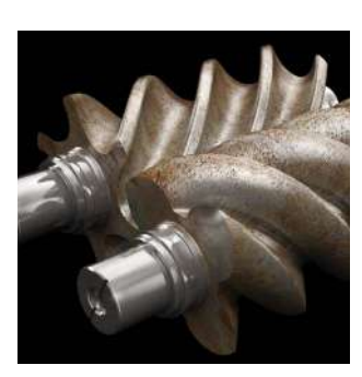
Rotors with conventional lubricant