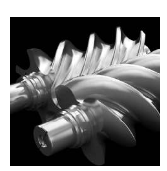
Rotors with Ultra EL lubricant